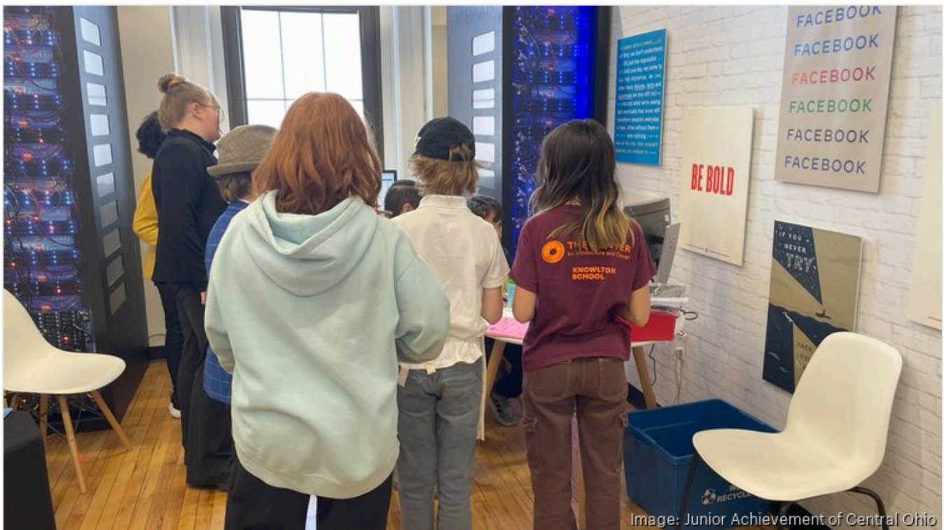
At BizTown, students get experience doing tasks in company-branded shops.

“We know that when we invest in (JA), that's exactly what's happening.”